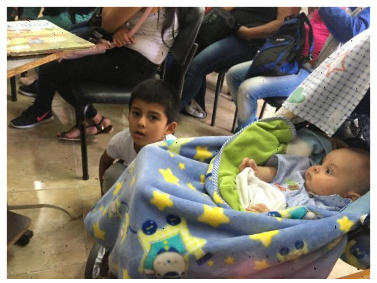
All the guests were very attentive to the talk, including the children. Photo taken on June 22, 2019.