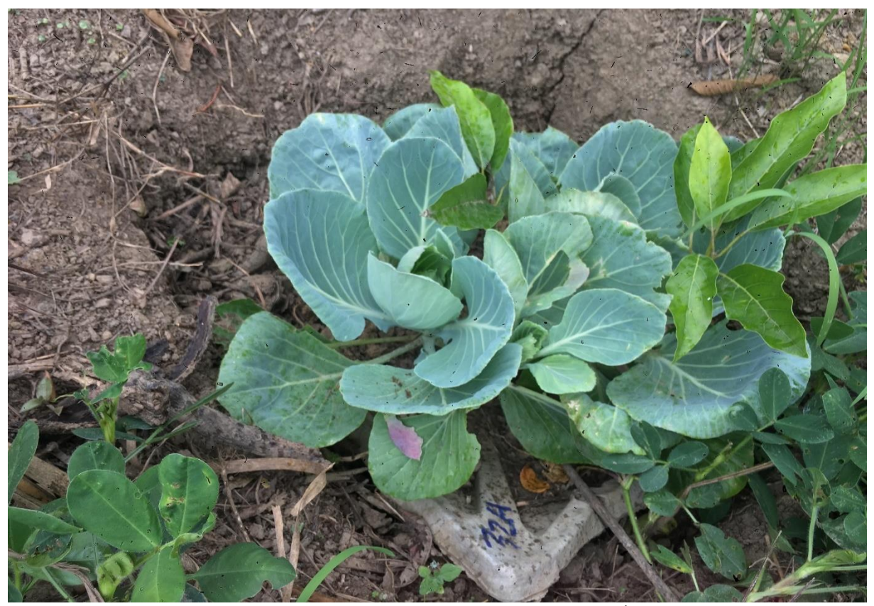
Gb # 324 Avocado of 59 cm + 2 cabbages. Photo taken on June 19<sup>th</sup> 2019 in Gonzalo.