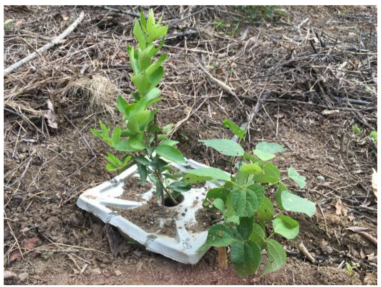
GB # 676 –Lemon tree of 78 cm. and beans. In this photo, you can also see the positive influence of the environment. Photo taken on June 17<sup>th</sup> 2019, Pitayas 2.

Visit to Herradura: The Herradura group is a small group of 10 participants but with amazing results in this Second Phase of the Project.