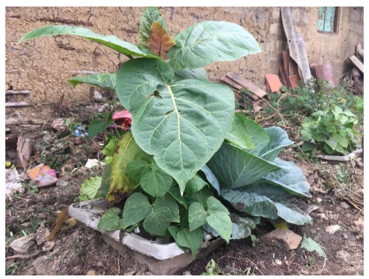
GB # 651 –Tree tomato of 77 cm + crispy lettuce + cabbage +beans. 4 vegetables and 1 tree in one box. Photo taken on June 17<sup>th</sup> 2019, in La Herradura.