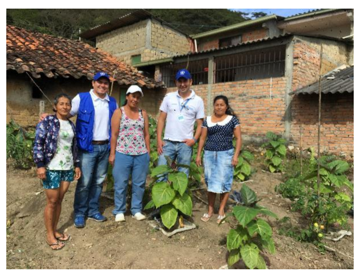
General view of the crop, WFP staff with La Herradura group. Photo taken on June 17<sup>th</sup> 2019, La Herradura.

Visit to Casablanca .- New group participating in this phase. There are 10 beneficiaries, they received 50 Growboxx, 50 tangerine trees and seeds of beans and tomatoes.