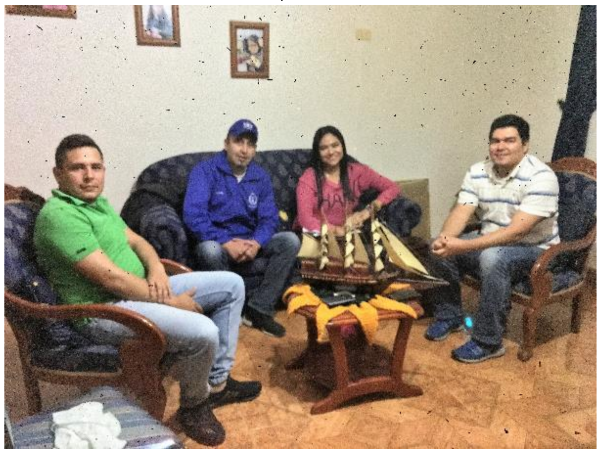
20190617 Meeting WFP - Groasis in Almaguer.