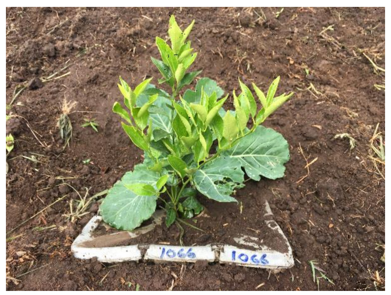
GB # 1066 Tangerine of 60 cm + 1 cabbage. Photo taken on June 21th 2019, Cerro Largo.