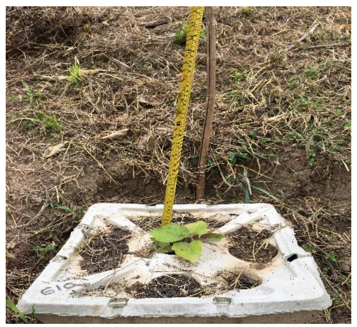
GB # 610 – tree tomato of 6 cm + 2 beans. Photo taken on March 12<sup>th</sup> 2019, in Altillo.