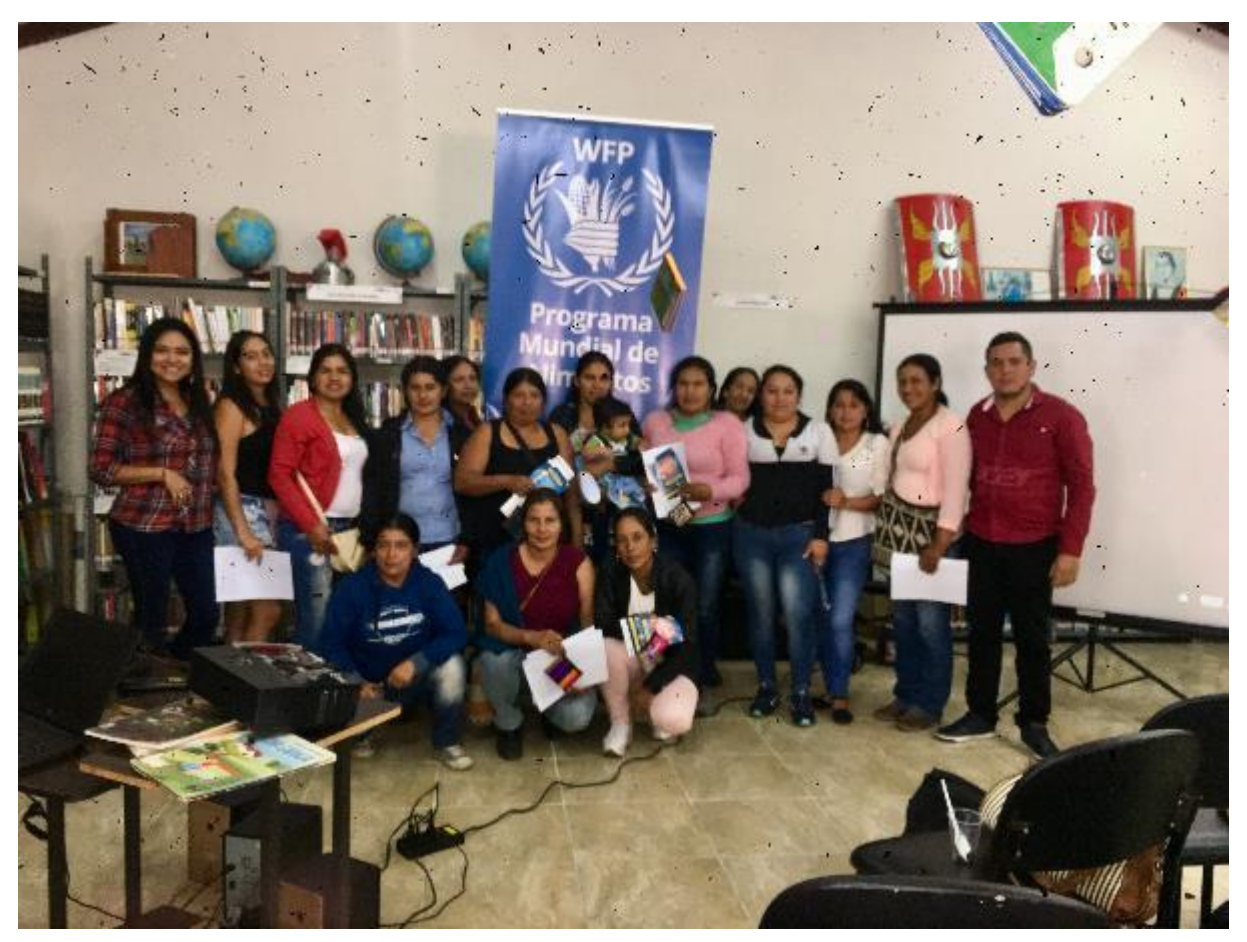
Group photo of all the participants in the exhibition. Photo taken on June 22, 2019.

Generally, the exhibition met our objective of reporting the results and communicating our interest in carrying out a reseeding with the Groasis Waterboxx, considering that 62% of Waterboxx are stacked in the houses of the beneficiary leaders.