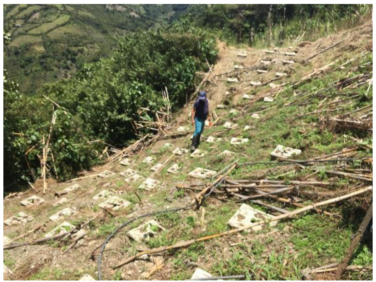
Top view of Groasis Growboxx with tree tomatoes in Gabrielas. Photo taken on March 15, 2019.