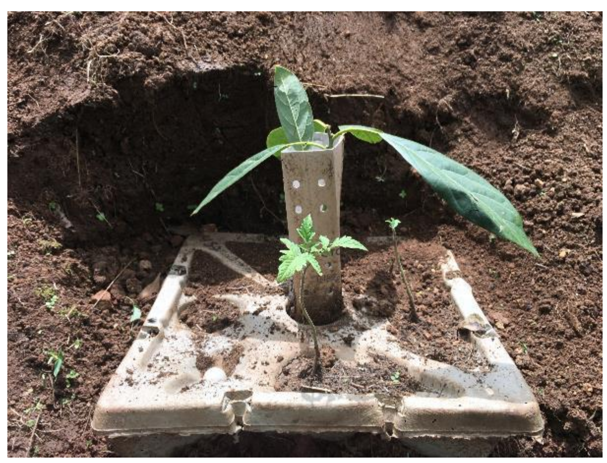
GB # 457 – Avocado + beans. Photo taken on March 12th 2019, in Yunga.