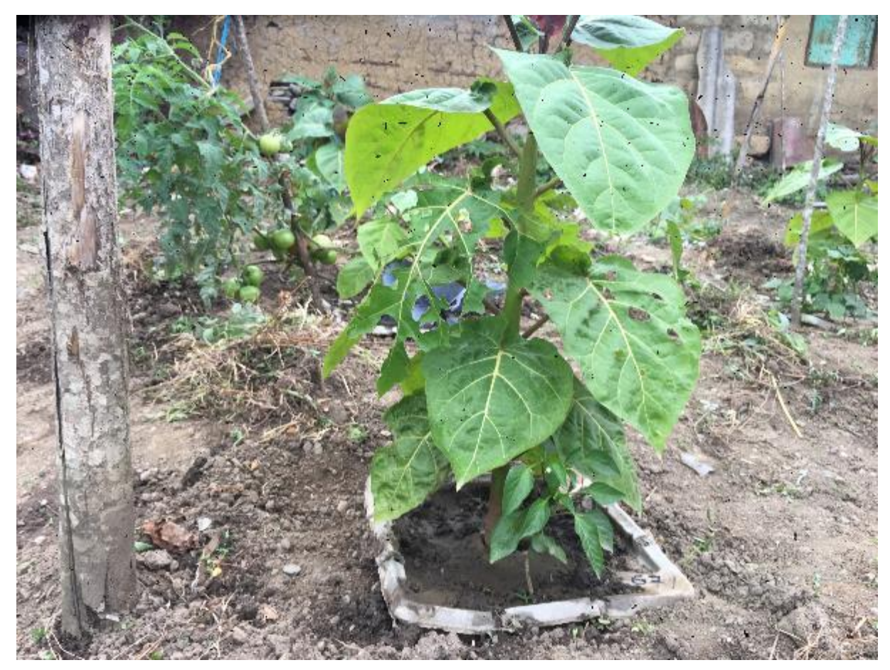
GB # 671 – Tree tomato of 106 cm in the center + Green pepper. Crispy lettuce was harvest last week. Photo taken on June 17<sup>th</sup> 2019, in La Herradura.