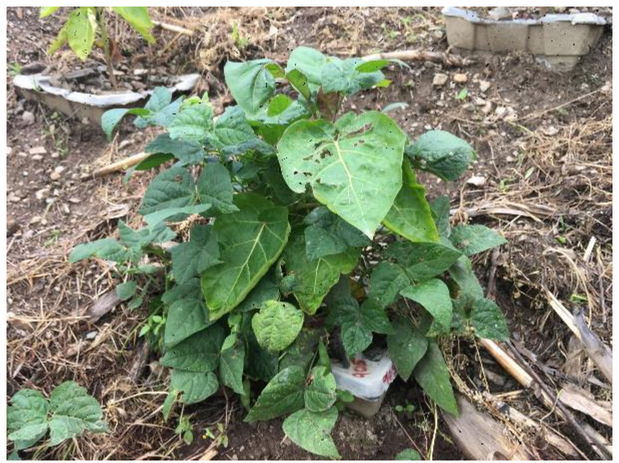
GB # 905 tree tomato of 54 cm + 2 beans. Photo taken on June 21th 2019 in Gabrielas.