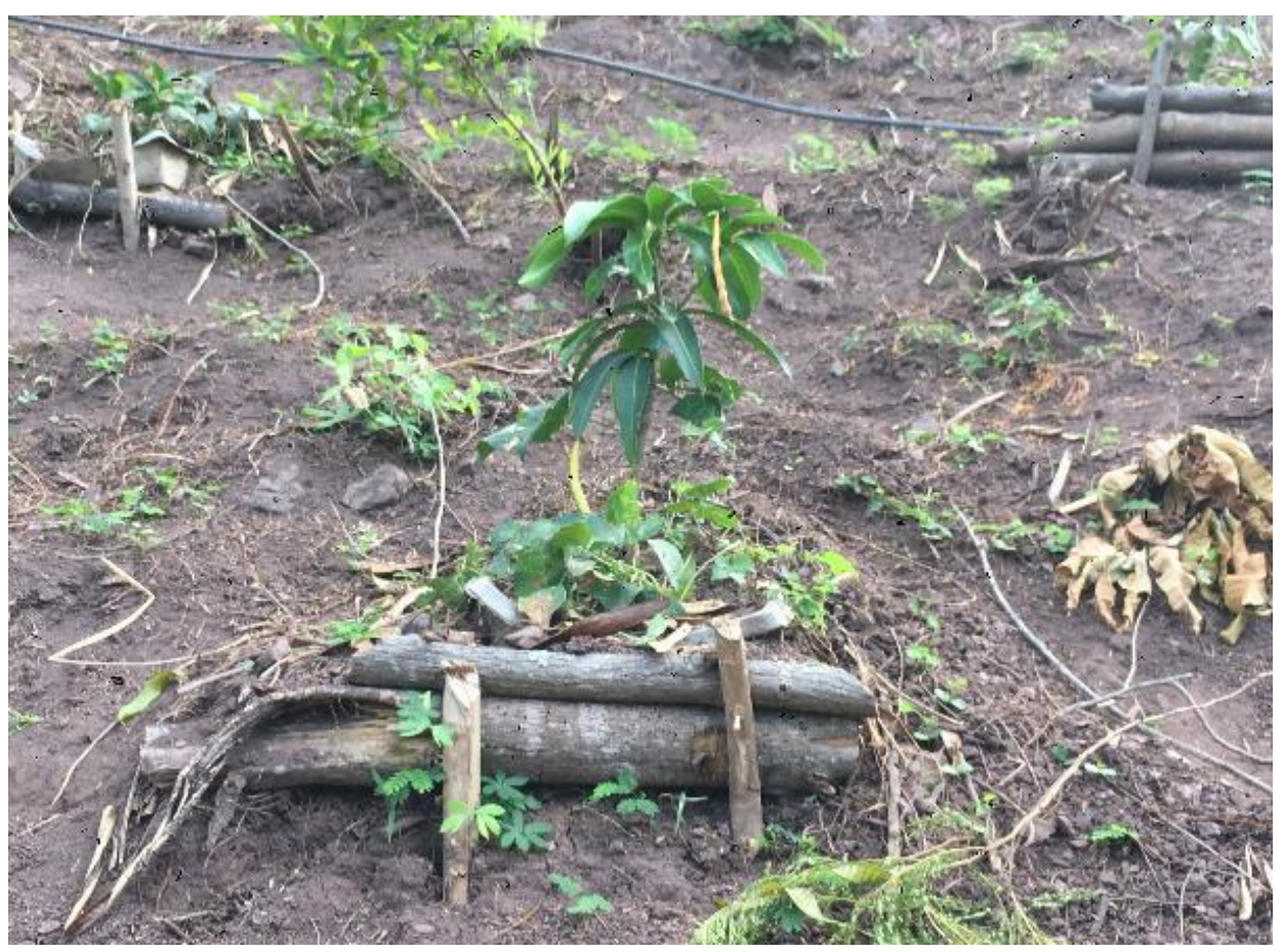
Farm in Tarabita 1 with pieces of firewood protection in the Growboxx to avoid landslides. Photo taken on June 20<sup>th</sup> 2019.