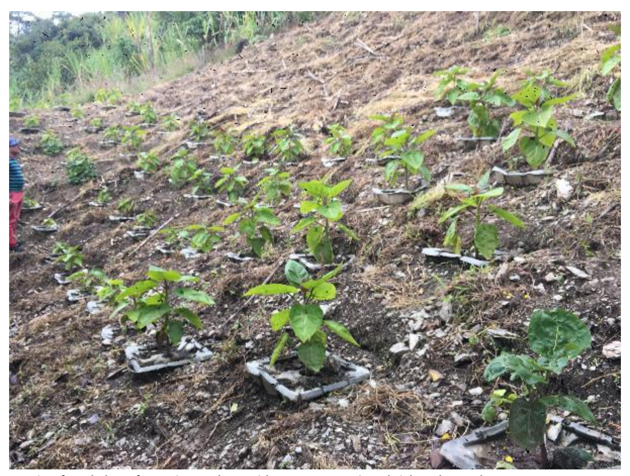
View from below of Groasis Growboxx with tree tomatoes in Gabrielas. Photo taken on June 21, 2019.