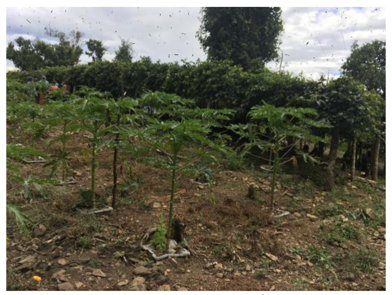
View of the crop with Growboxx - Photo taken on June 19th. 2019, in Palizada.

As we know, Palizada received in February 2018, 90 Groasis Waterboxx devices, the same ones that have not been removed from the cultivation of passion fruit until now. They continue to use the devices as sources / reservoirs of water for their trees.