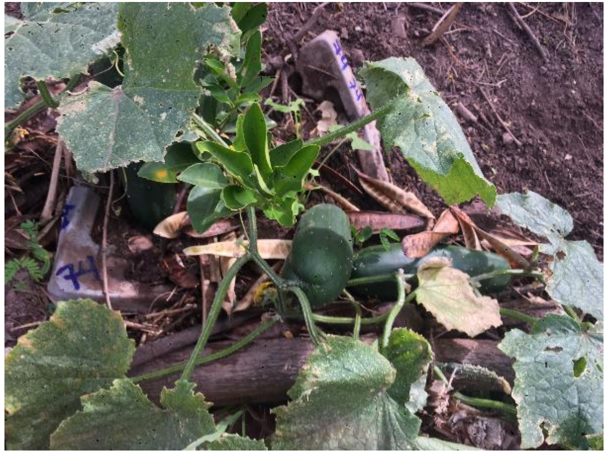
Gb # 74 Mango of 52 cm + cucumbers. Photo taken on June 20th 2019, in Tarabita 1.

In Tarabita 1, 48 Waterboxx were reused with passion fruit.