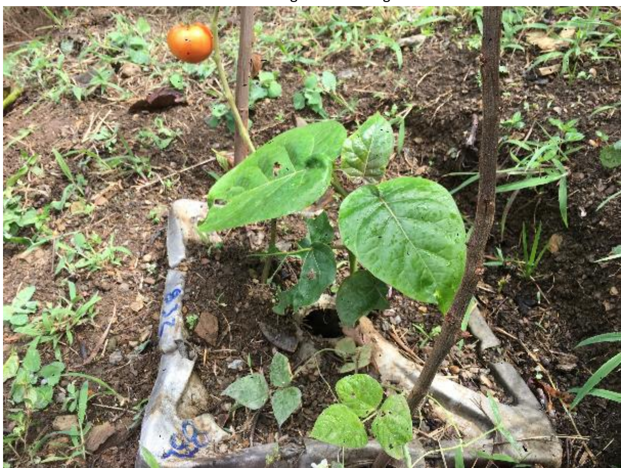
GB # 832 tree tomato of 43 cm + 1 tomato Chonto + 1 beans. Photo taken on June 20<sup>th</sup> 2019, in site 2 of Juan Ruiz.