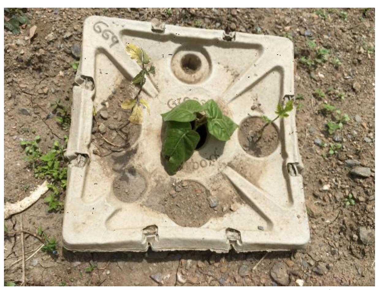
GB # 669 –Tree tomato in the center + 2 little tomatoes seedlings – Photo taken on March 11<sup>th</sup> 2019 in La Herradura.