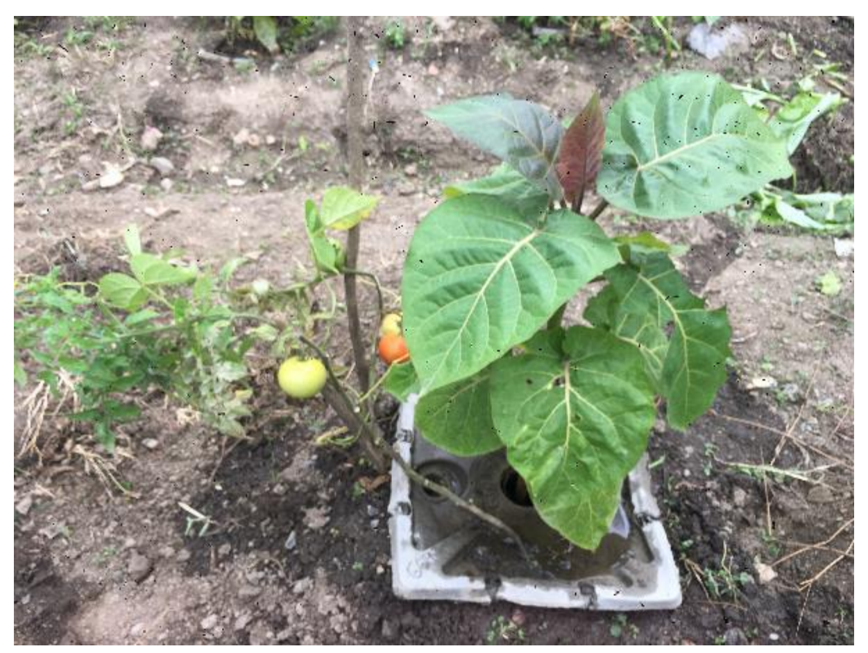
GB # 669 –Tree tomato of 86 cm in the center + tomatoes with fruits – Photo taken on June 17<sup>th</sup> 2019 in La Herradura.