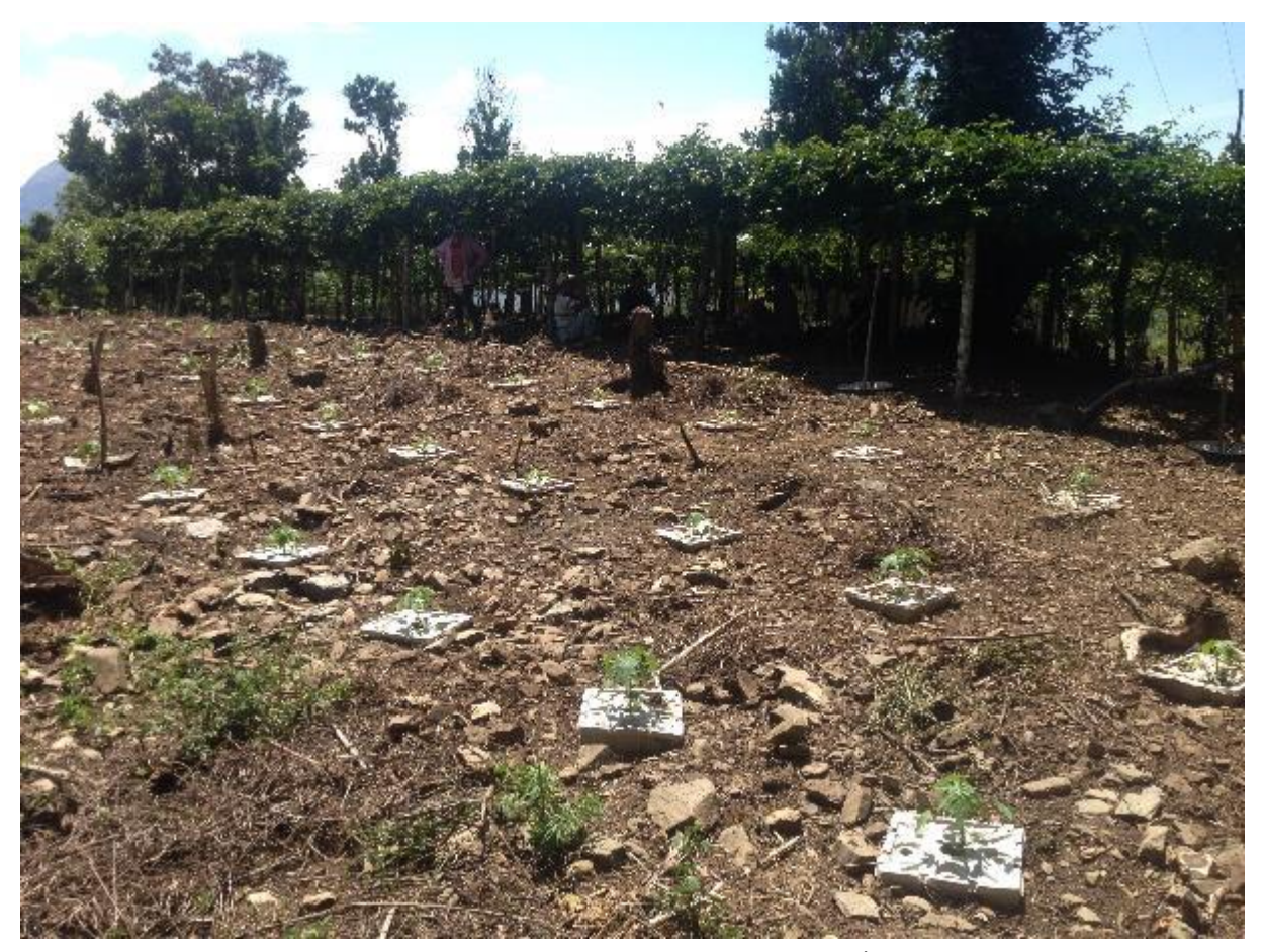
View of the crop with Growboxx - Photo taken on March 13<sup>th</sup> 2019, in Palizada.