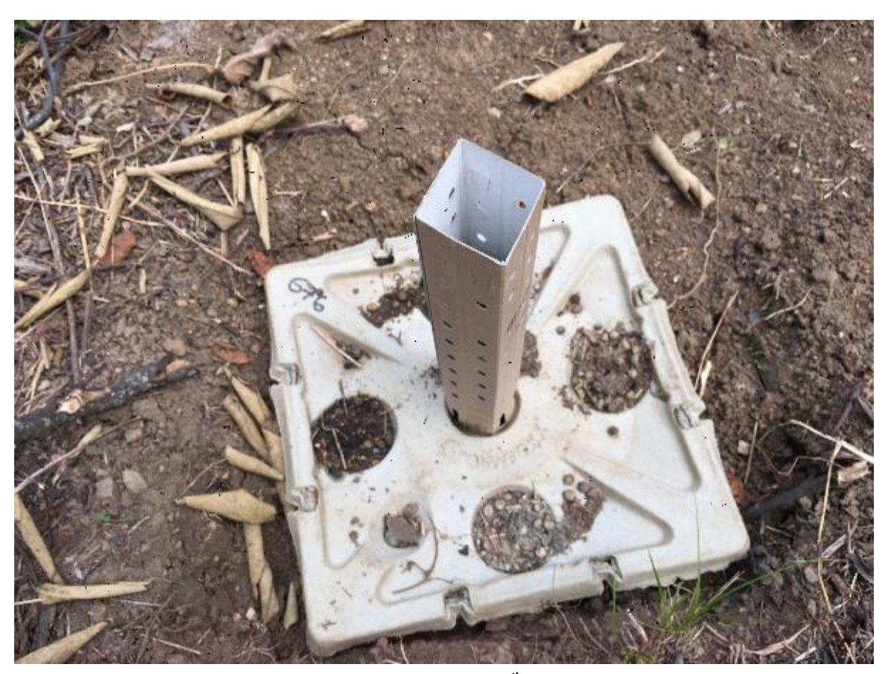
GB # 676 – Photo taken on March 11<sup>th</sup> 2019 in Pitayas 2.