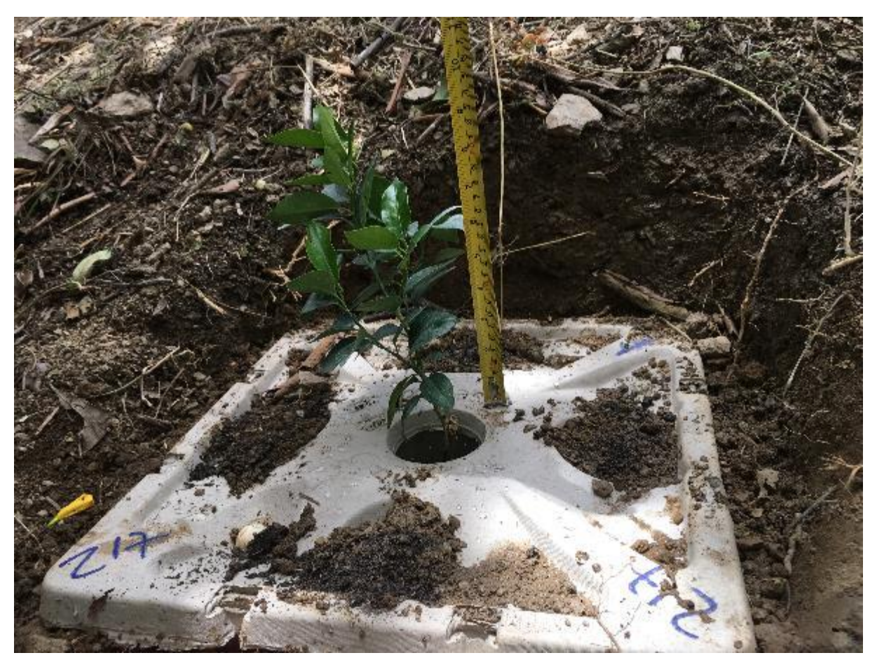
GB # 217 – Tangerine of 19 cm + seeds of beans – Photo taken on March 11<sup>th</sup> 2019, in Casablanca.