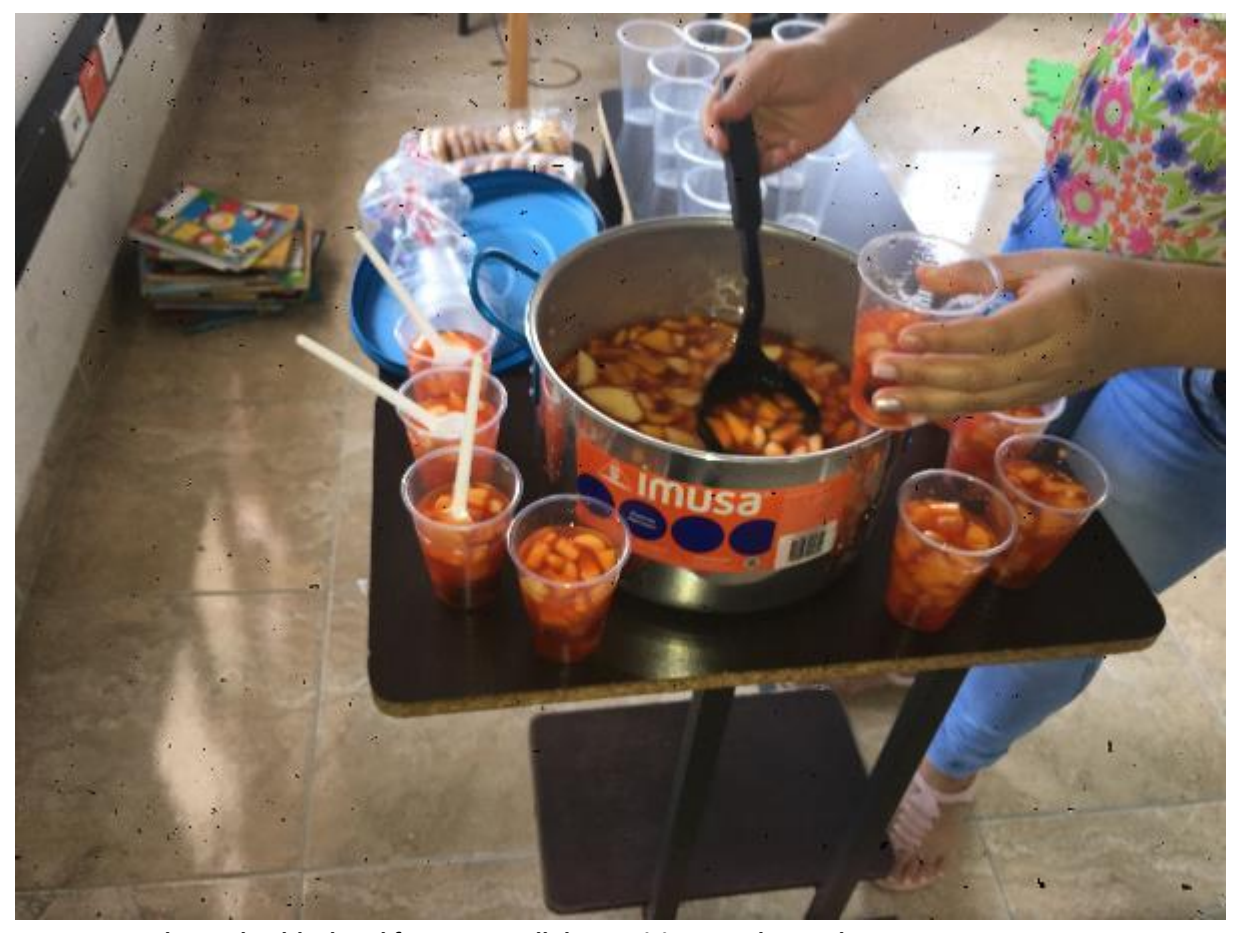
We share a healthy breakfast among all the participants. Photo taken on June 22, 2019.