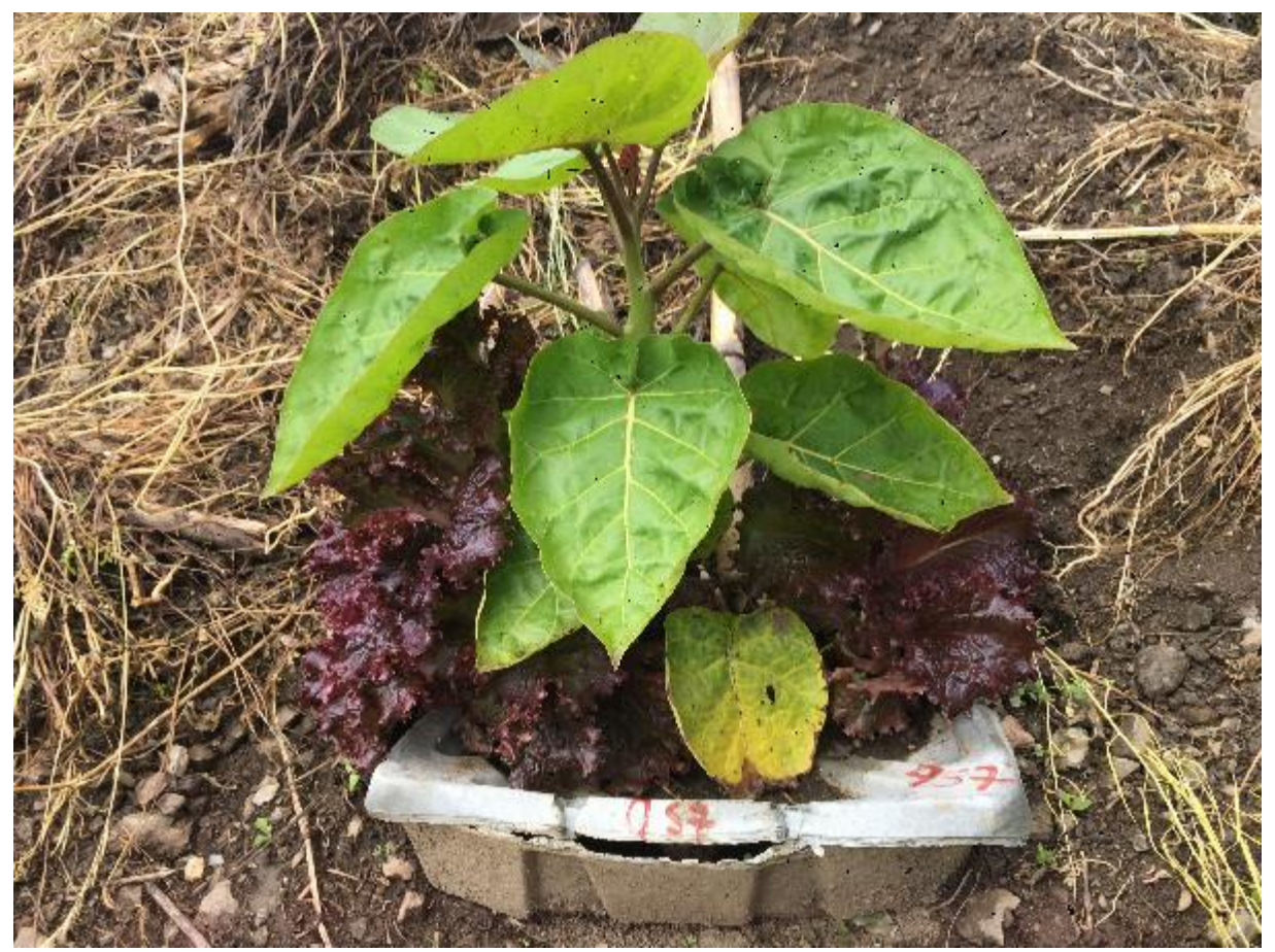
GB # 957 tree tomato of 72 cm + 2 purple lettuces. Photo taken on June 21th 2019, in Gabrielas.

After the visit in Gabrielas, the colleagues of the PMA left us in the Municipality of Almaguer and we said goodbye. They continued their journey to Pasto. We prepared our material for the exhibition the day after.