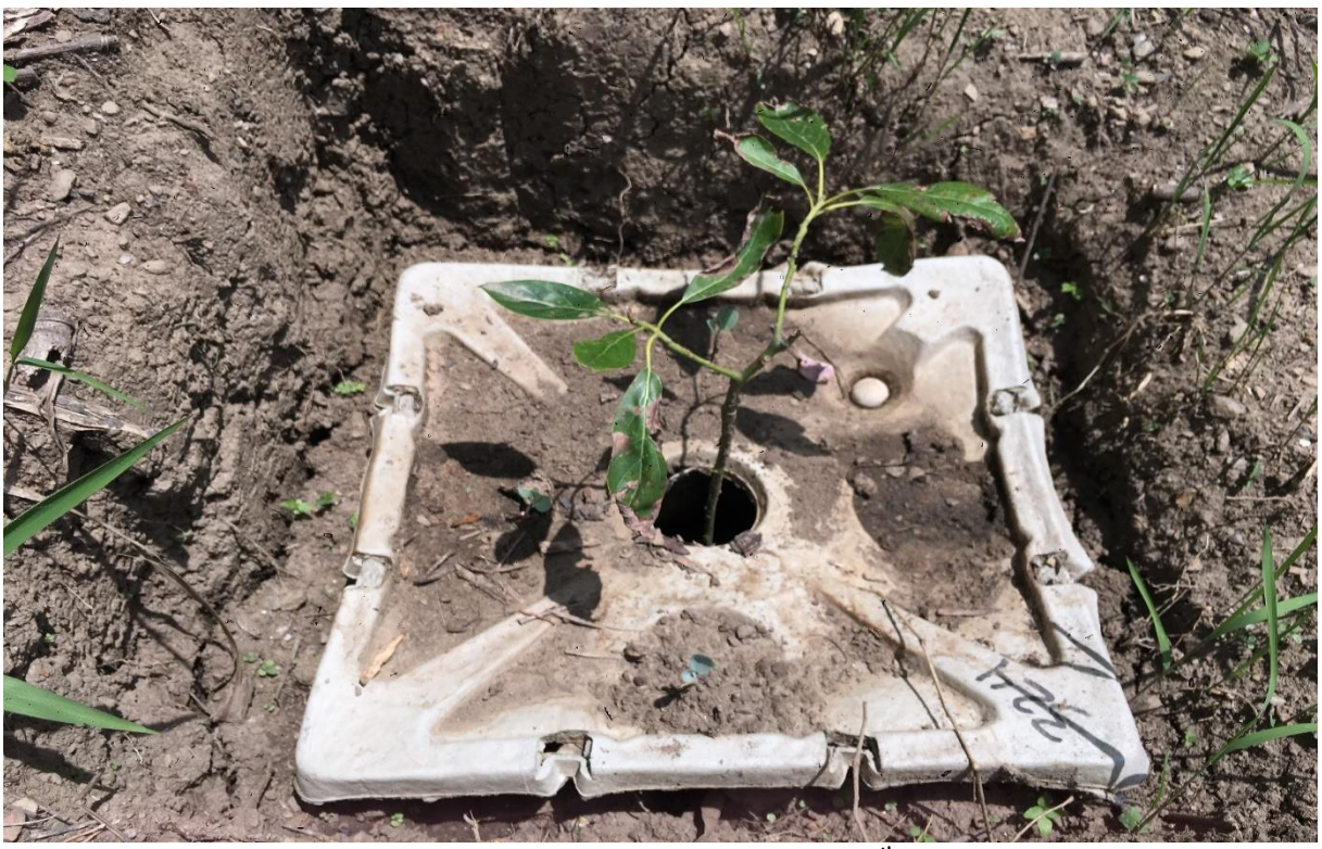
Gb # 324 Avocado + cabbages. Photo taken on March 13<sup>th</sup> 2019 in Gonzalo.