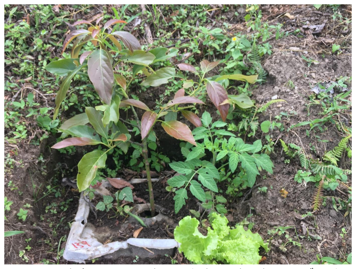
GB # 139 –Avocado of 78 cm + 2 tomatoes Chonto + 1 crispy lettuce – Photo taken on June 19<sup>th</sup> 2019, in Achiral.