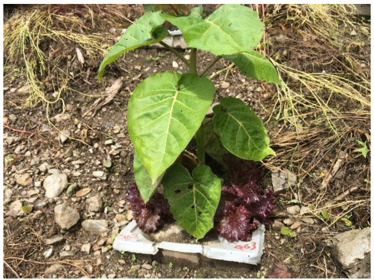
GB # 963 tree tomato of 84 cm + 2 purple lettuces. Photo taken on June 21th 2019, in Gabrielas.