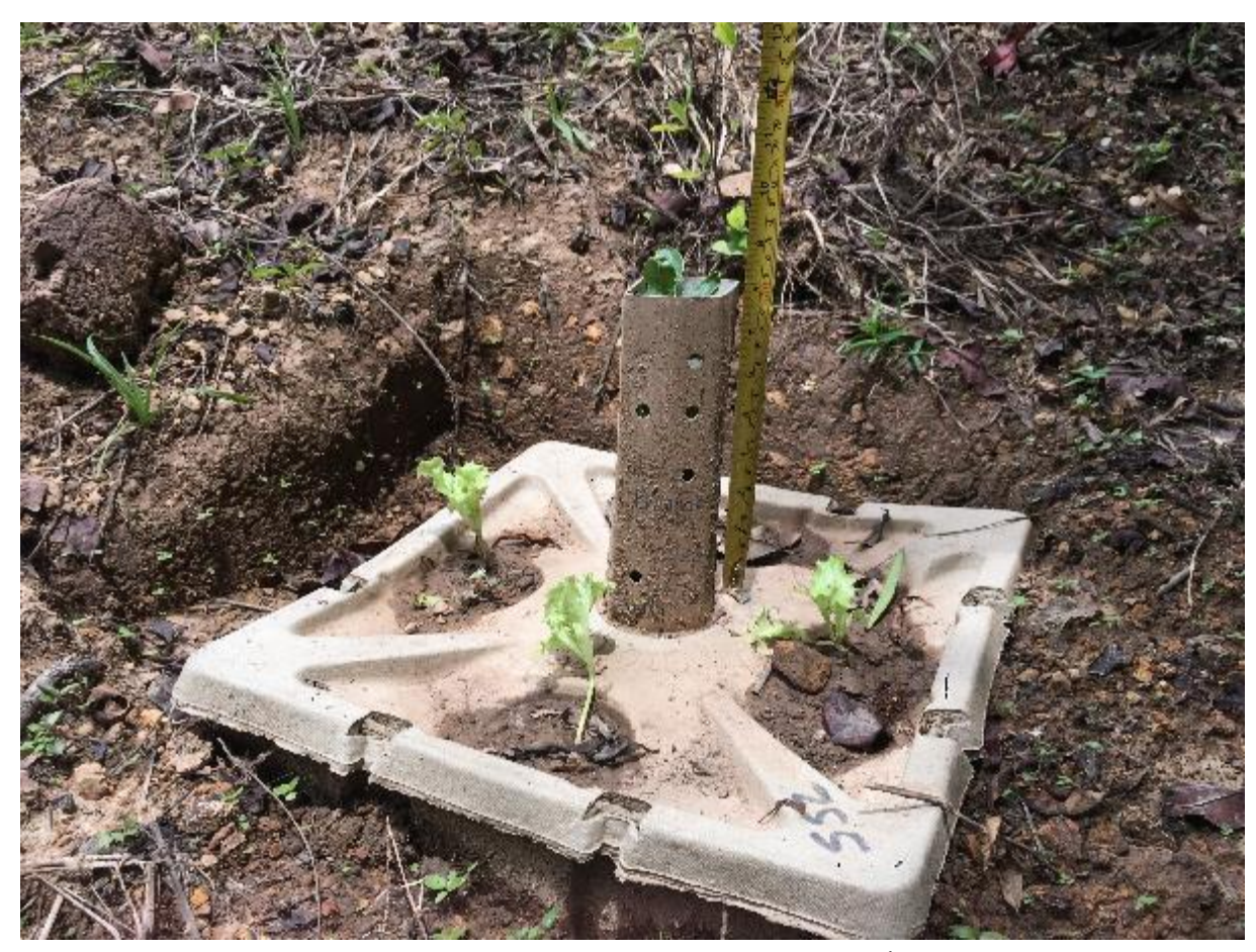
GB # 552 – Tangerine of 20 cm + crispy lettuces -Photo taken on March 12<sup>th</sup> 2019, in Yacuanas.