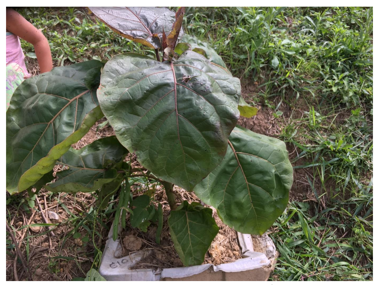
GB # 610 – tree tomato of 79 cm + beans. Photo taken on June 18<sup>th</sup> 2019, in Altillo.