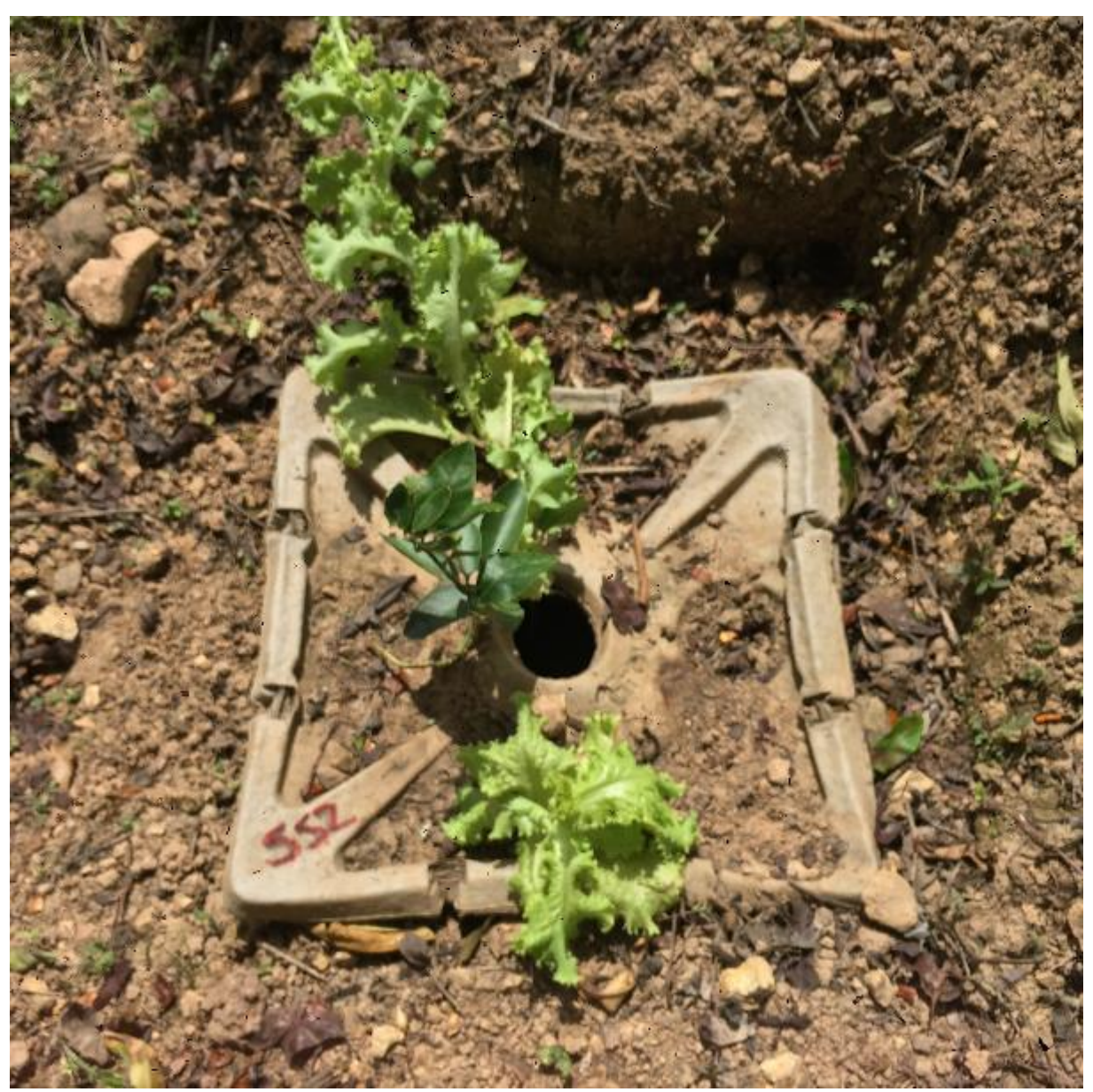
GB # 552 –Tangerine of 42 cm + crispy lettuces -Photo taken on June 18<sup>th</sup> 2019, in Yacuanas.