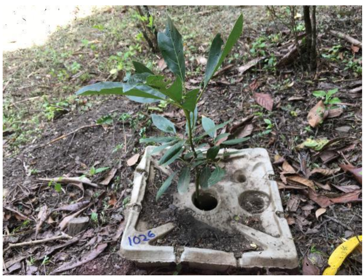
GB # 1026 Avocado of 71 cm. Photo taken on June 20th 2019, in Sauji.