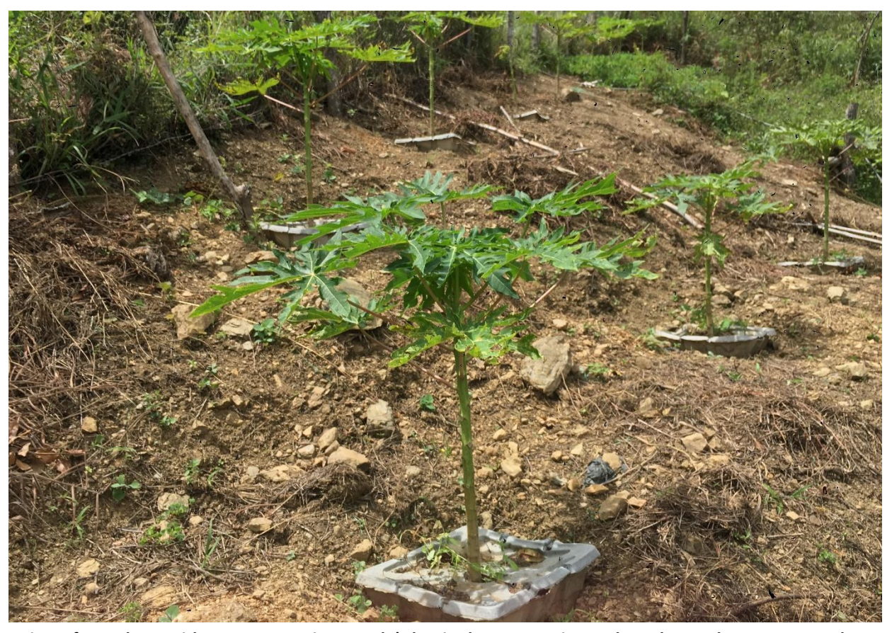
View of Growboxx with papaya trees in Gonzalo's lot, in the community garden. Photo taken on June 19th. 2019.