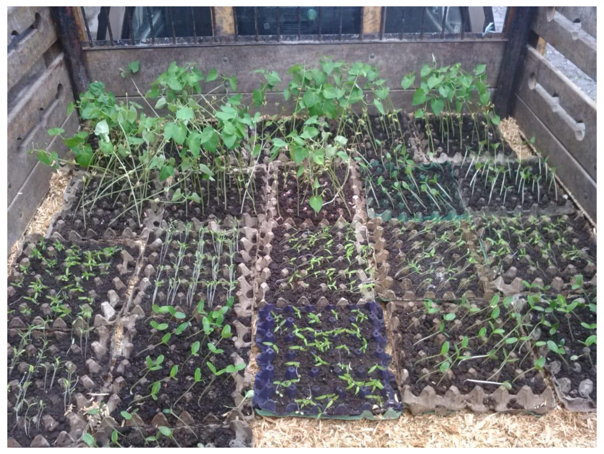
Short cycle vegetables, ready to deliver. Photo taken on April 4, 2019.

In the following tables, the number of trees delivered to each group, the name of the species and the total of trees monitored in this Second Phase of the Project are detailed: