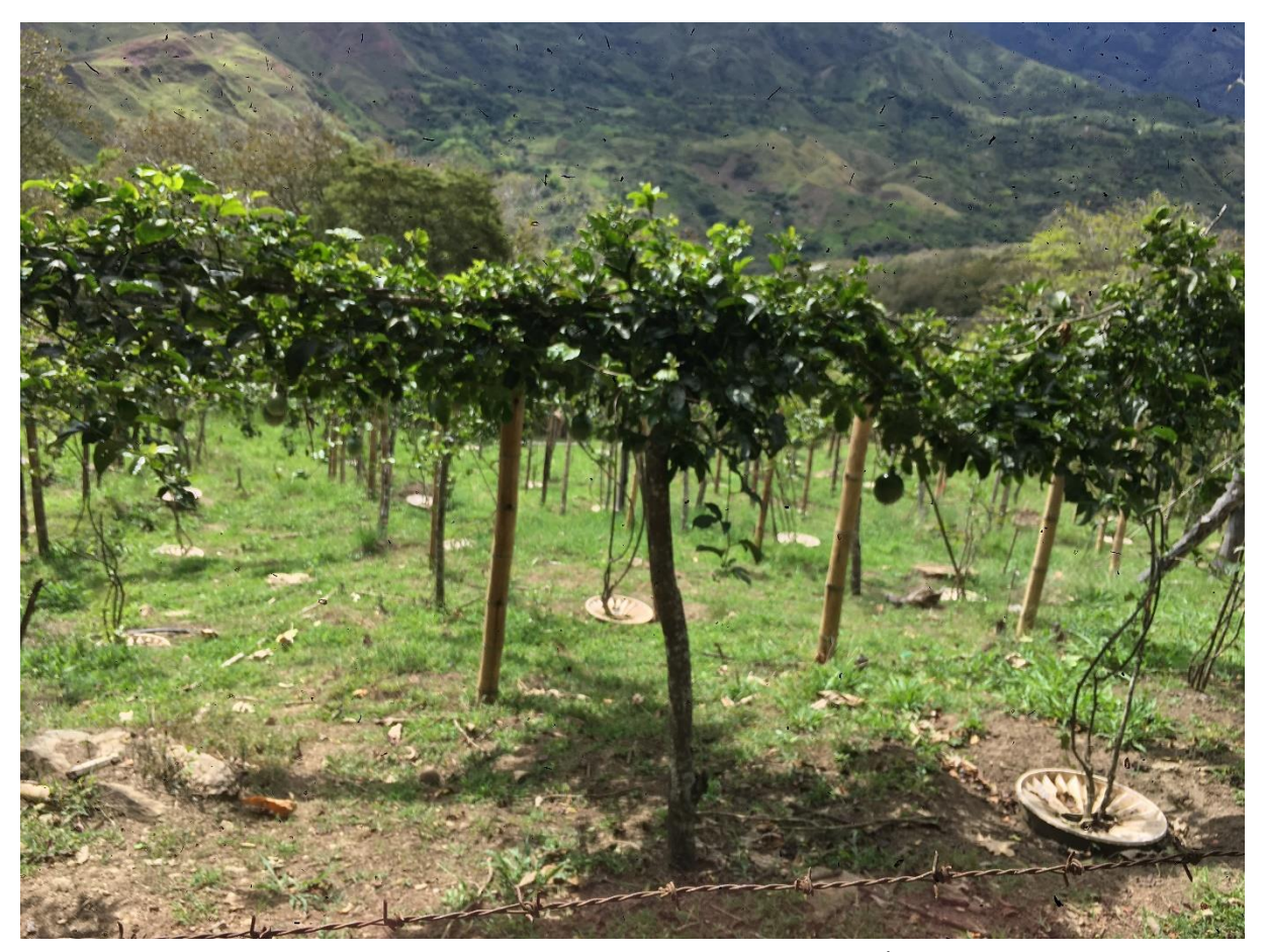
Crop with maracuyás = passion fruits. Photo taken on June 19<sup>th</sup> 2019 in Elvecia.