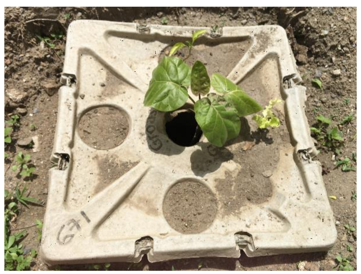
GB # 671 –Tree tomato + crispy lettuce + green pepper – Photo taken on March 11<sup>th</sup> 2019, in La Herradura.